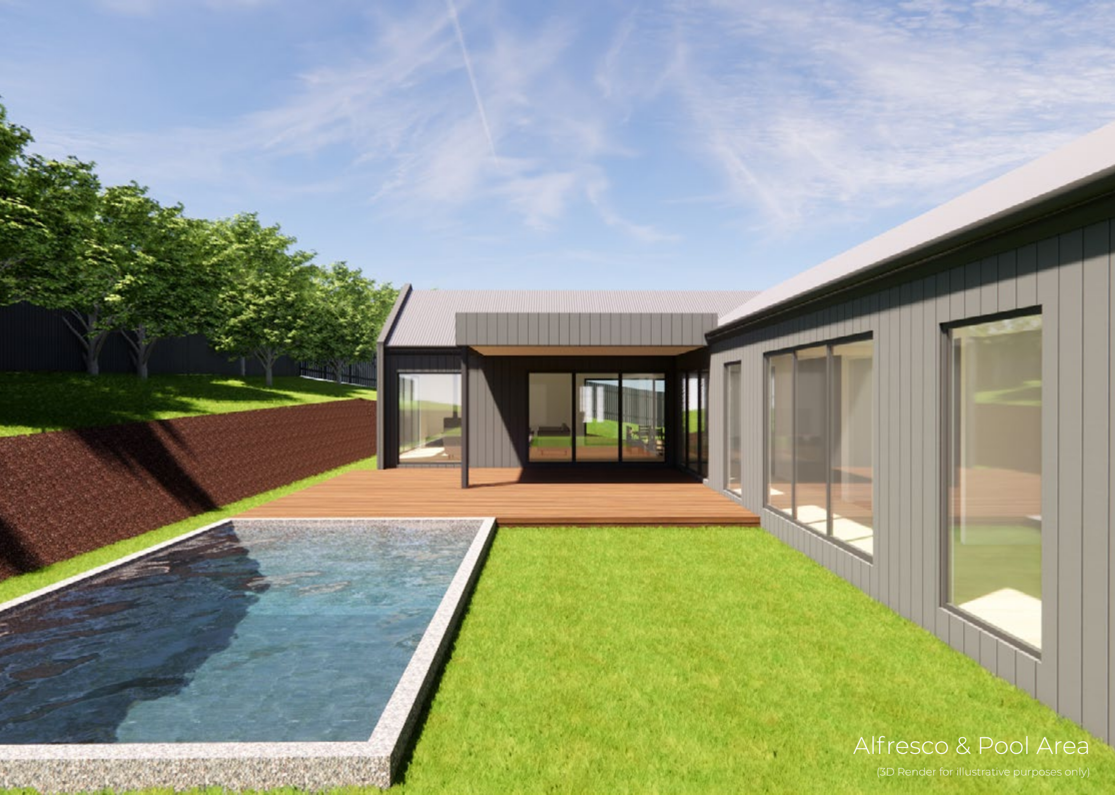
Alfresco & Pool Area (3D Render for illustrative purposes only)