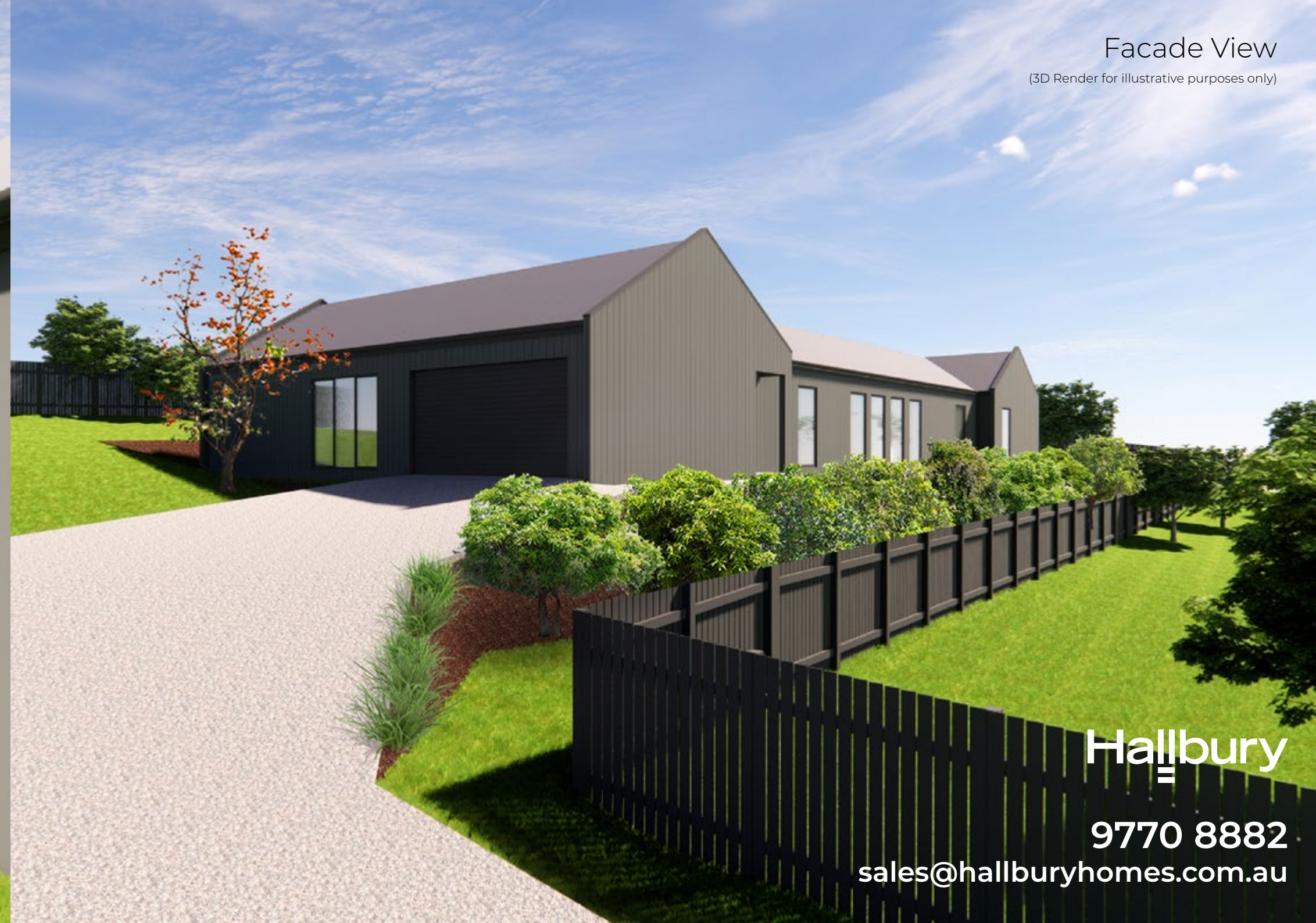
Facade View (3D Render for illustrative purposes only)